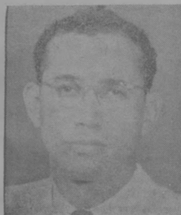
DON VICTOR NAVAS Governor of the Province of Colon

We are sincere in the belief that no man can long fight for himself without fighting for others; that no man can portray the crying need of his people without reflecting the similar needs of others. For a job well done in the assembly halls of the United Nations, we find ourselves co-partners in indebtedness to Dr. Ricardo J. Alfaro, Panama's Foreign Minister.