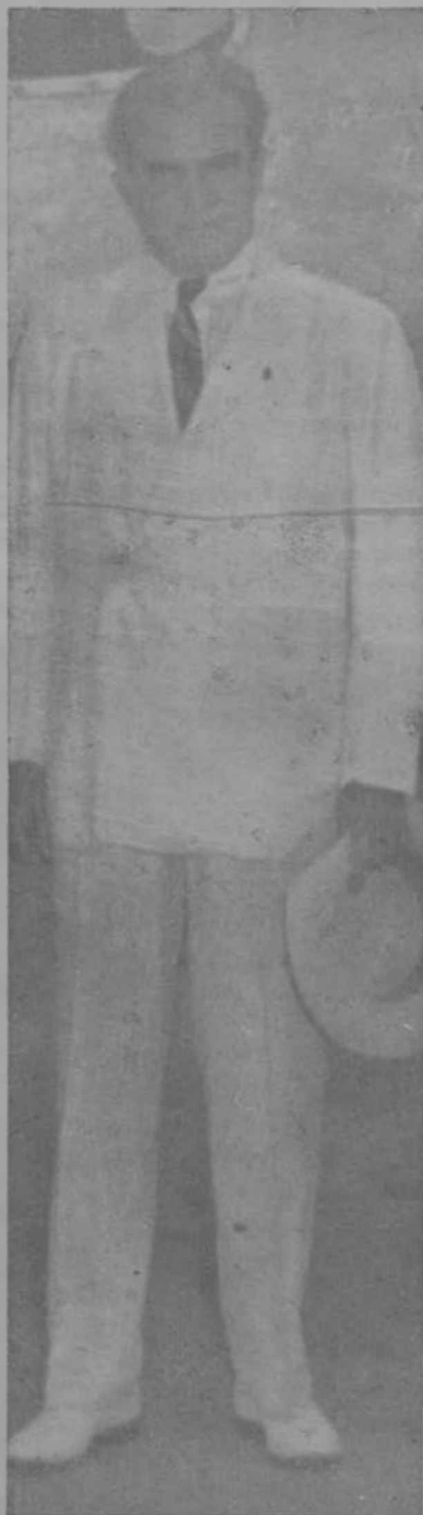
DON E. A. JIMENEZ President of the Republic of Panama