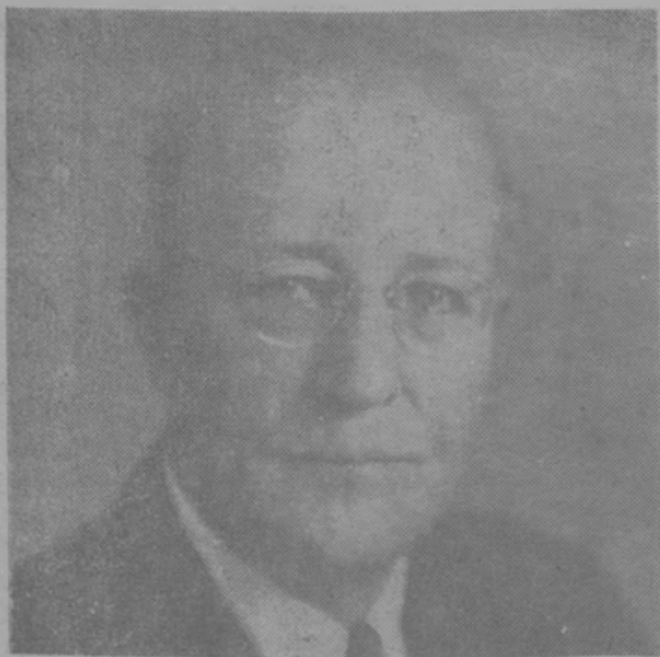
MAJ. GENERAL J. C. MEHAFFEY Governor of the Panama Canal