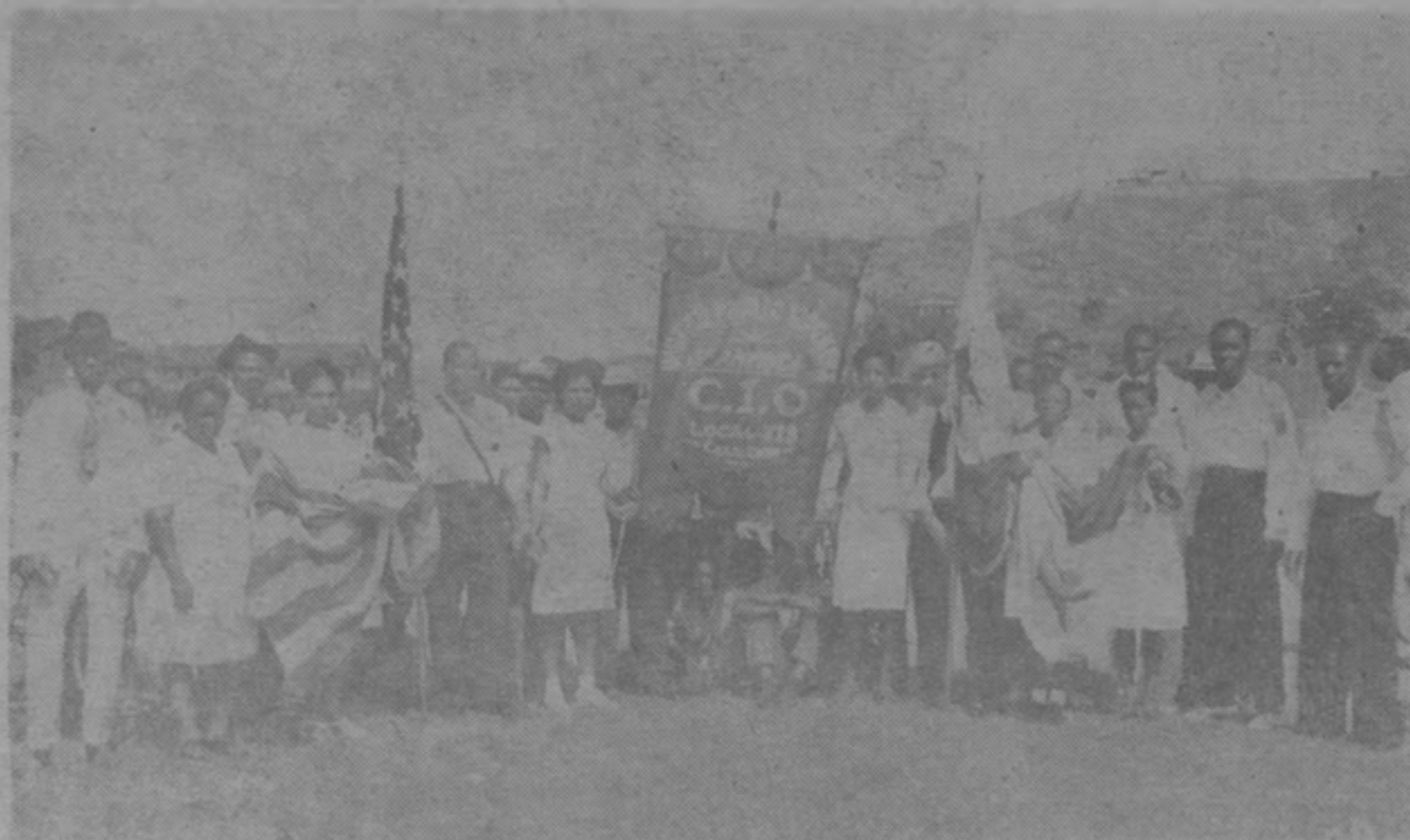
(2) The Union banner is shown above, flanked by the Panamanian and American flags.

On the Pacific parade, where the units from the Commissary Division stole the show by appearing 100% in white and with their own banner, the Community Band led the way with 3 C.I.O. cyclists while several aged patriars braved