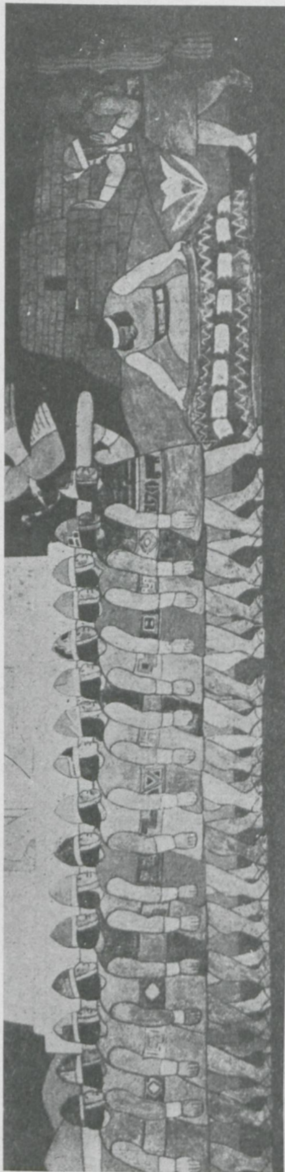
"EL INCA", friso.