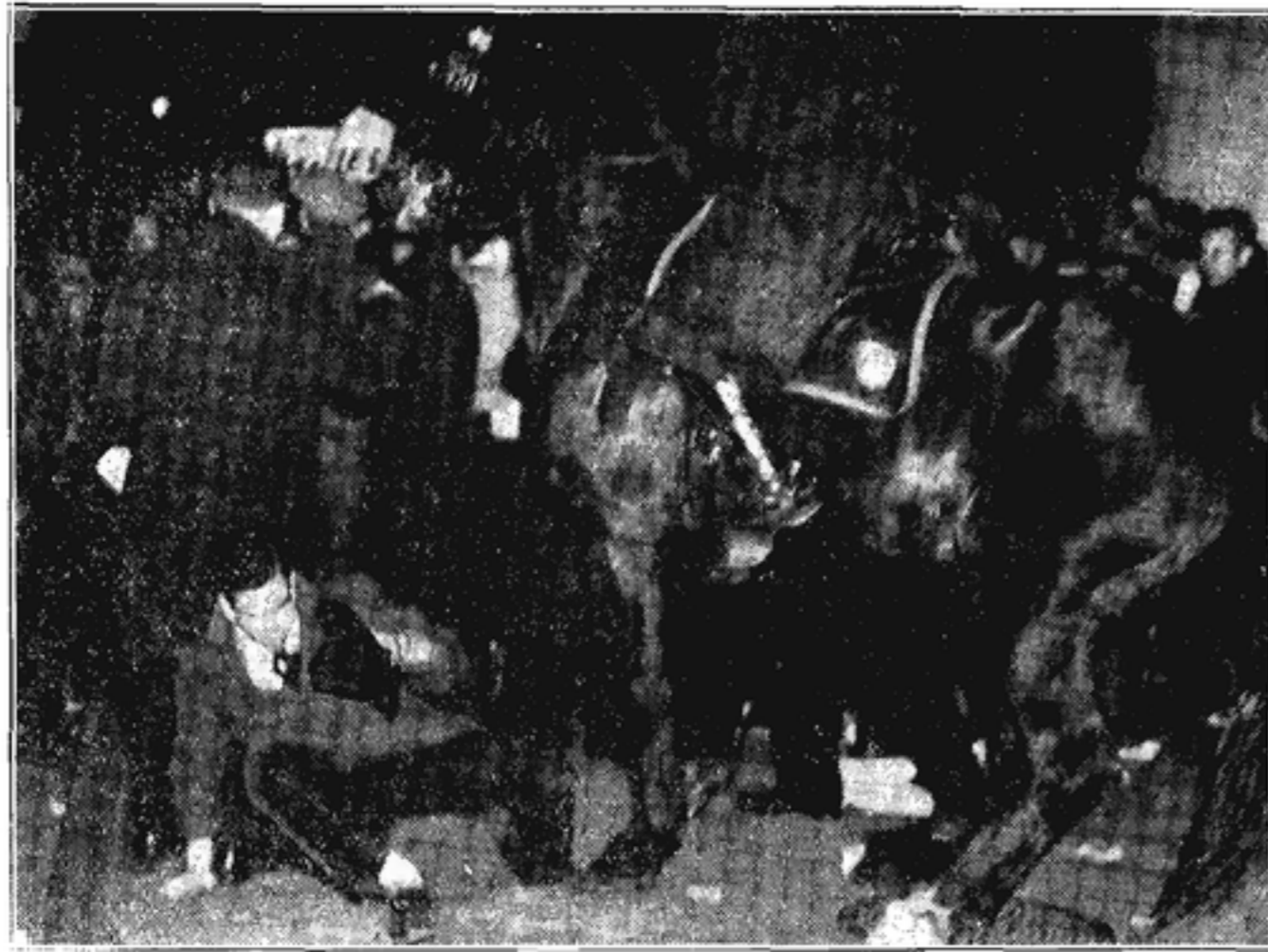
The Democratic horses of the Democratic Cossacks of Democratic Mayor LaGuardia are defending Democracy outside Madison Square Garden by rolling down and slugging workers who tried to exercise their democratic right to assemble and picket the Nazi gangsters whom the police protected so tenderly. That's a Little Lesson that the workers are learning.

In addition to legal defense for these defendants, the American Fund provided medical attention for twelve other demonstrators who were seriously injured when police protecting the Nazi meeting spurred their horses into crowded picket lines.