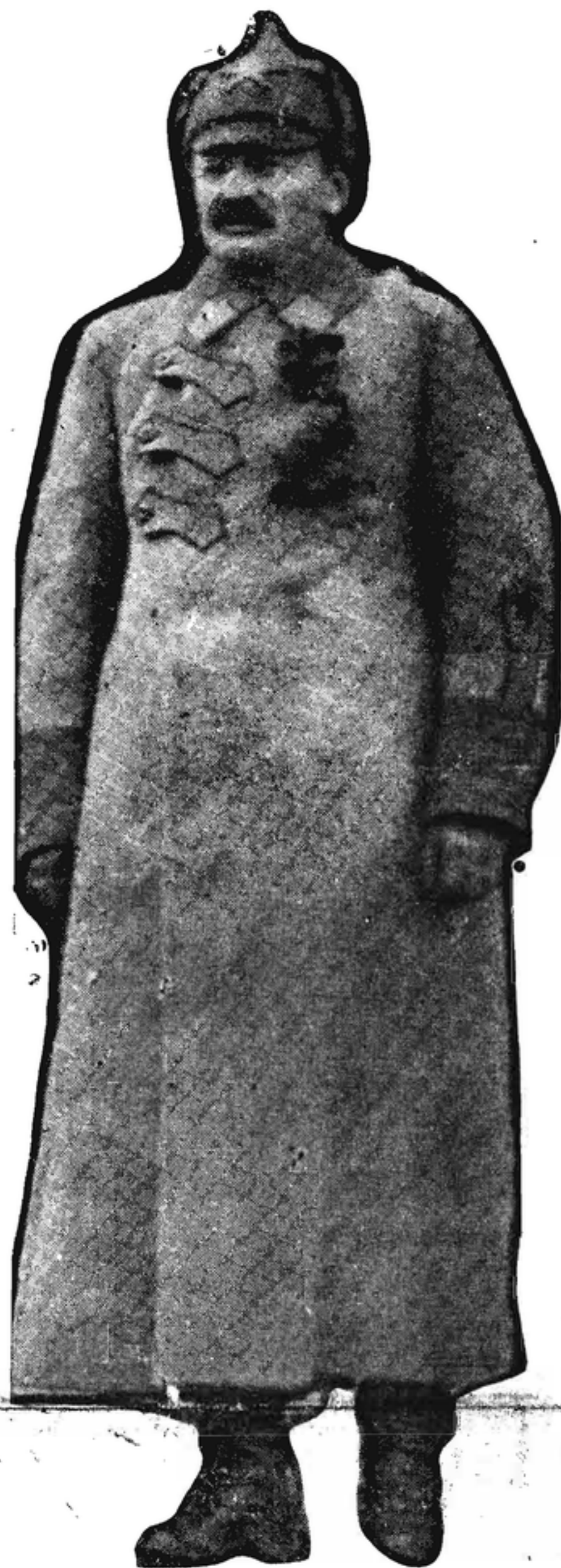
Trotsky, the warrior of the workers' revolution, as commander of the Red Army in 1918-1922.