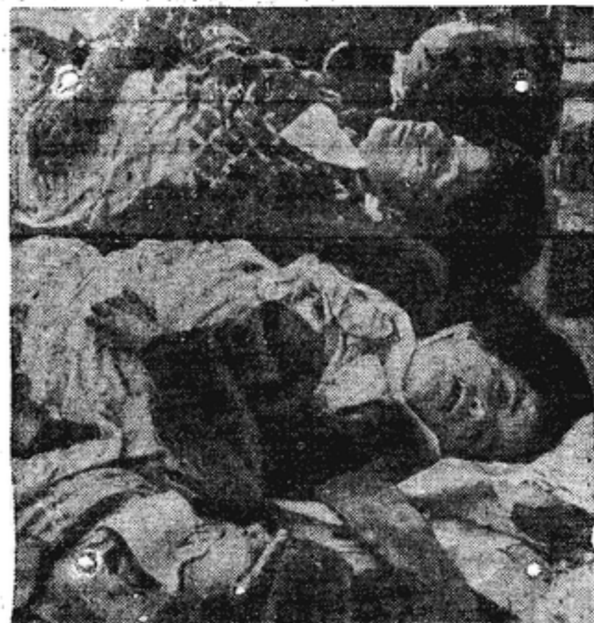
Victims of Franco's Bombers

fectively to fill their role as the most loyal servants of the imperialist bourgeoisie, the leading standard-bearers of bloody capitalism in the era of its horrible bankruptcy—in the era when it can submit the pressing social problems of its own creation only to the arbitrament of mass slaughter of the peoples.